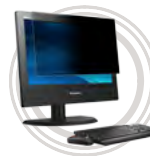
3M Monitor Privacy Filter Privacy Protection & Anti-Glare