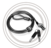
Lenovo™ Kensington® MicroSaver® DS Cable Lock Reduce Thieves, Easy to Install